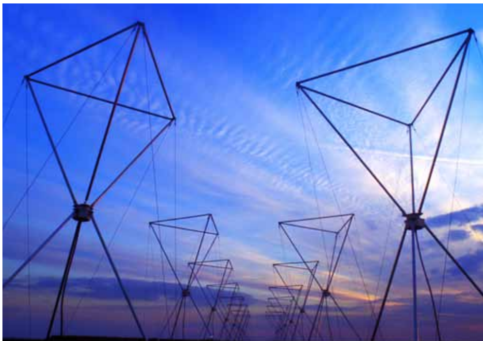
HFSWR provides unique low level target detection and tracking capability

For maritime situation awareness HFSWR is particularly effective when integrated with other sensor and identification systems.